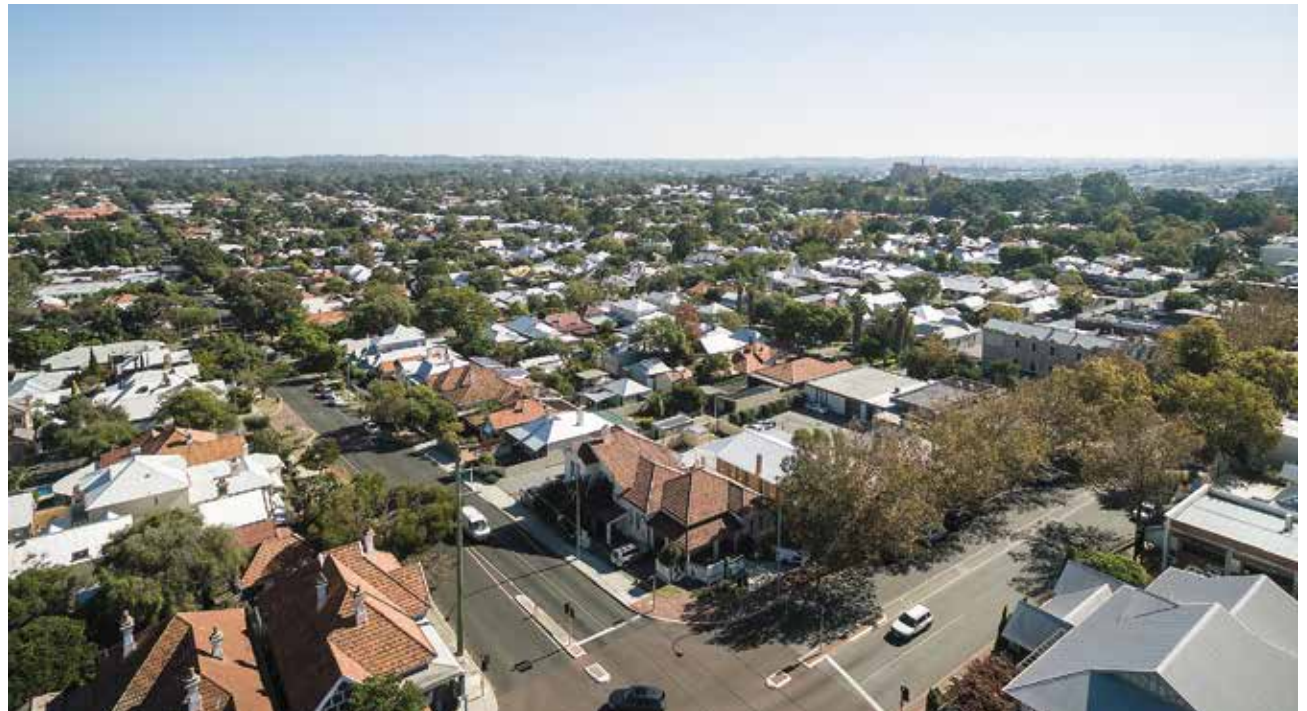
Statewide, there were 23,985 build starts for FY21.

Price spikes and difficulties obtaining labour have not only led to project delays but have forced some out of the game altogether.