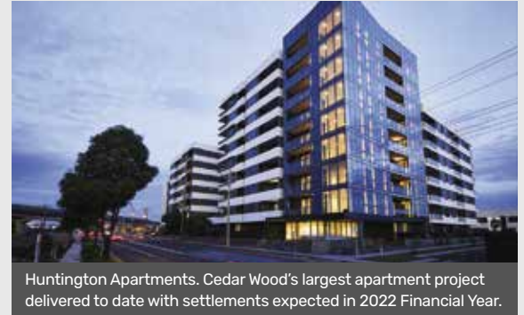
Huntington Apartments, Cedar Wood's largest apartment project delivered to date with settlements expected in 2022 Financial Year.