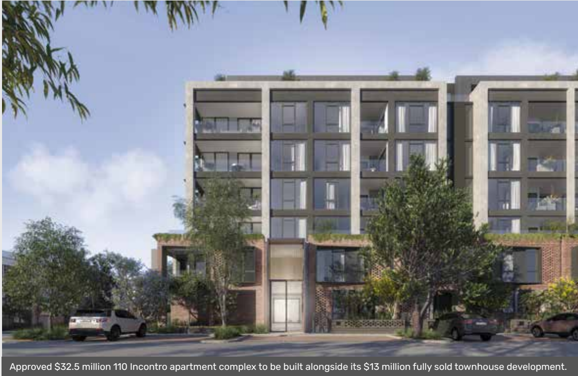
Approved $32.5 million 110 Incontro apartment complex to be built alongside its $13 million fully sold townhouse development.