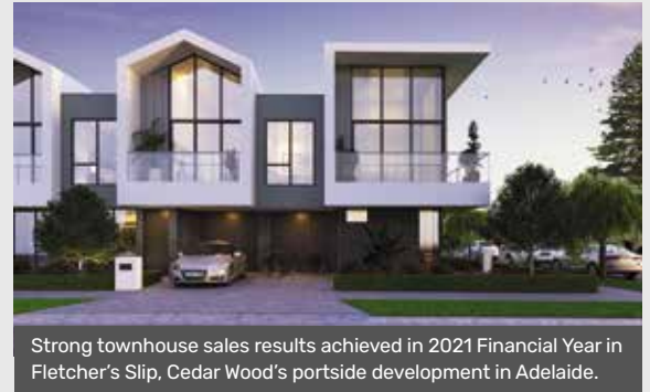
Strong townhouse sales results achieved in 2021 Financial Year in Fletcher's Slip, Cedar Wood's portside development in Adelaide.